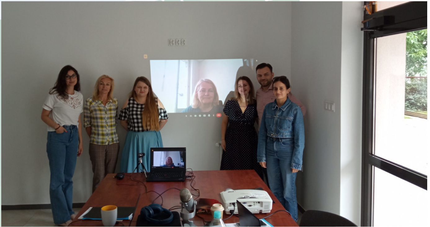
Now-See project team on face-to-face meeting

NOW-SEE: New Opportunities for Women through Sustainable Environmental Entrepreneurship